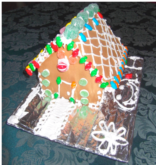
House and photo from Erika Burgoyne Hongell

Welcome to the Winter edition of the Burkittsville News. I'm happy to be able to continue a few things from last winter, for example, featuring a stunning gingerbread house on our front page!